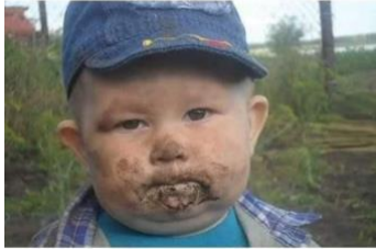
Me? When I was 3, I ate mud

Today's 3 year olds can switch on laptops and open their favorite apps