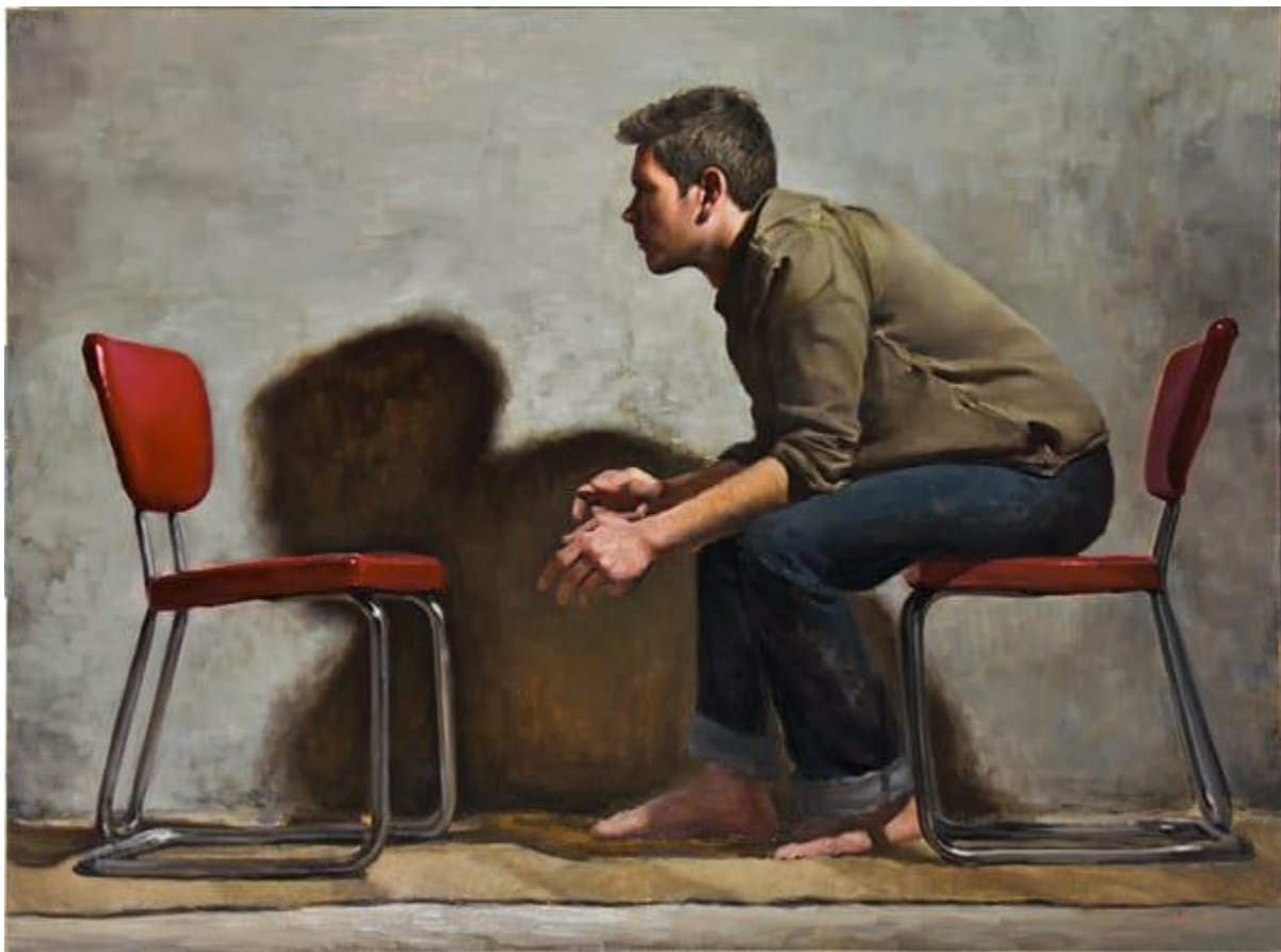
(Art: 'Conversation' by Zack Zdrade)

~Doris Lessing (Book: The Golden Notebook)