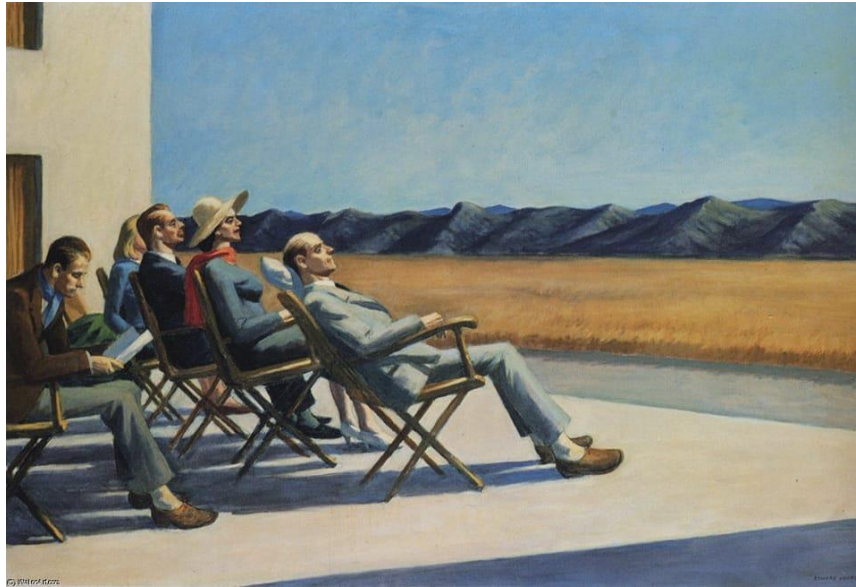
(Art: 'People in the Sun', 1960 by Edward Hopper)