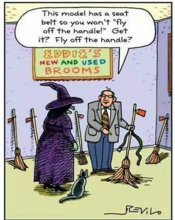
THE NIGHT EDDIE BECAME A TOAD.